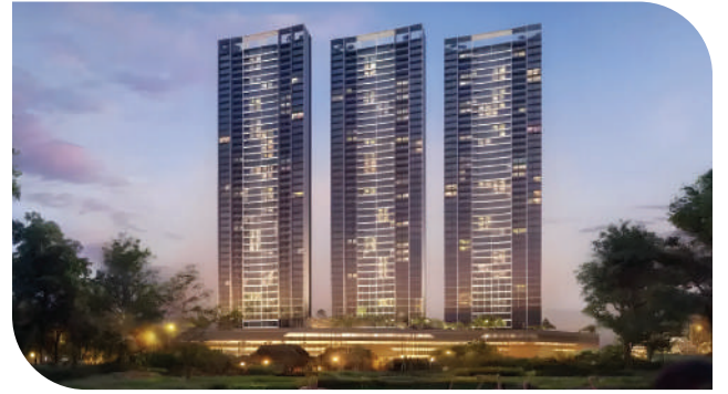
Delta New Palm Beach