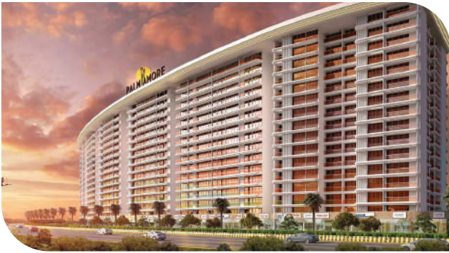
Gami Palm Amore