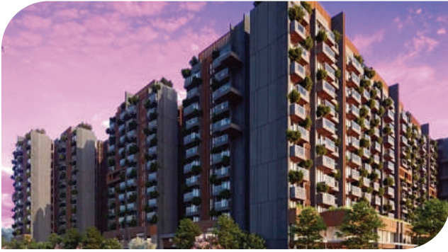
Adani 9 PBR